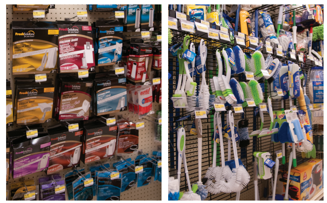
Crown Point True Value carries hand-held tools, like brooms and dusters, to make cleaning projects easier. The store also carries a selection of vacuum bags. Thayne Hardware has also carved space for vacuum accessories, parts and vacuums.

"This category has been trending toward more DIYers," Rodeck says. "While consumers may feel more comfortable hiring outside help for plumbing or electrical projects, the trend in the cleaning category has been the return of that customer group. Rather than hiring cleaning companies to manage the mess, consumers are taking these household chores into their own hands."